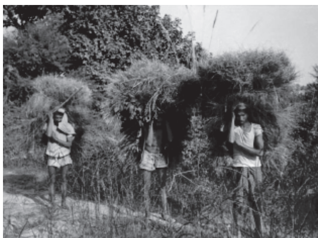
Photo 8.4 Extraction of fodder