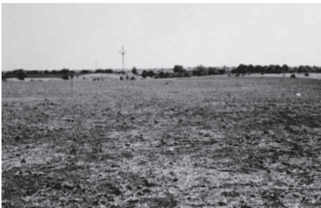
Photo 8.7 Soil erosion

Soil erosion by water results largely in the loss of top soil and terrain deformation, being a function of geological formation, rainfall, susceptibility to erosion, length and steepness of slope, cultural practices, vegetative cover,