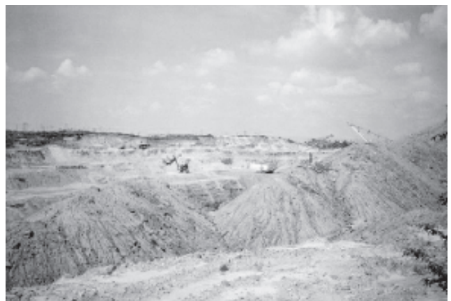
Photo 8.5 Land degradation due to mining activities