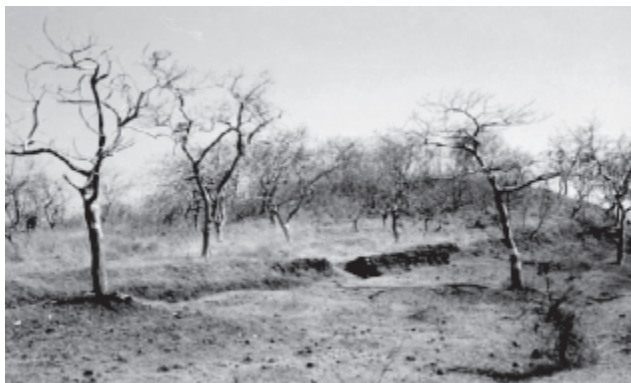
Photo 8.2 Land degradation due to erosion

unpermissible levels of timber, firewood, and fodder extraction from the forests. The demand for commercial timber comes from industries including pulp and paper, plywood, packaging, housing, matchwood, sports goods, furniture, agricultural implements and railway-coaches (FSI 1987). The total demand for timber, including small timber, was estimated at 64.4 million cum for 1996 with a growth rate of 5% per annum (FSI 1995).