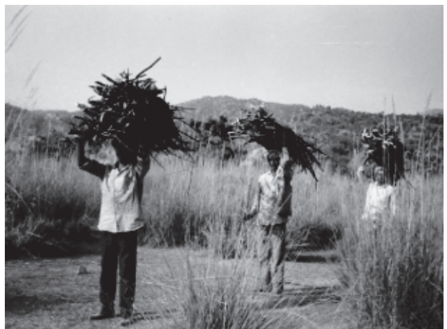
Photo 8.3 Firewood extraction