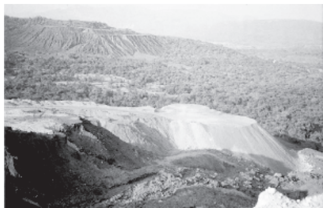
Photo 8.6 Overburden dumps in forests