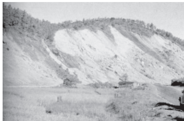
Photo 8.8 Forest degradation and soil erosion in West Khasi hills, Meghalaya

Narayana and Ram Babu (1983) analysed the existing data on soil loss and concluded, as a first approximation, that soil was being eroded at an annual average rate of 16.35 tonnes per hectare, yielding a figure of 5.3