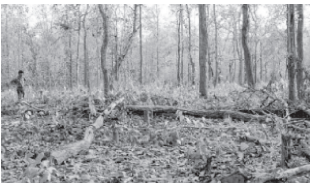
Photo 8.1 Land degradation due to deforestation

when the land cleared is steeply sloping, or has shallow or easily erodible soils; and secondly, where the clearance is not followed by good land management (Photo 8.1). Between 1980 and 1990, forests were depleted at the rate of about 0.34 mha annually while, afforestation efforts covered about one mha of area annually during the same period (MoEF 1999). Forests in India have also been shrinking owing to pressures from user groups.